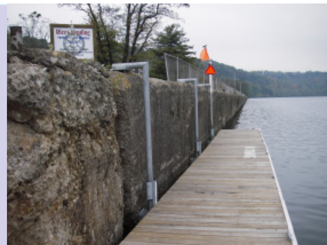
Rice's Landing, PA, Old Lock Six. The new municipal docks begin at launch ramp on Pumpkin Run (left), then right-angle and head north along the old lockwall (above). Public restroom, rail trail, and restaurant are nearby.