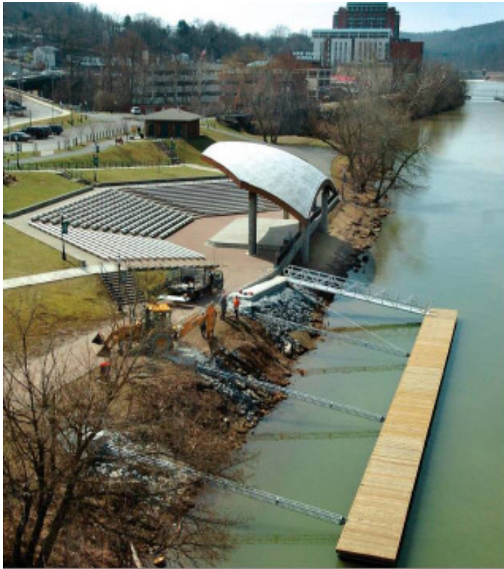
View from Westover bridge: Hazel Ruby McQuain Park, dock, and amphitheatre, with parking garage, WVU Foundation building and Waterfront Place Hotel in background. Rail trail and restaurants are nearby.