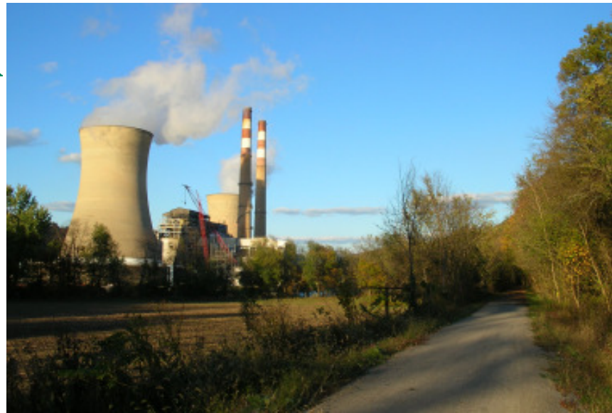
Mon River Trails Conservancy ( www.montrails.org ): showing rail trail about one mile south of WV-PA border. Across the Monongahela River is Allegheny Power's Fort Martin power plant.