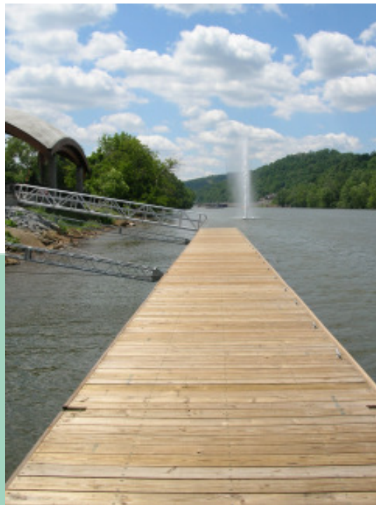
Looking south: McQuain amphitheatre dock, the river fountain, and in the distance Morgantown lock and dam. UMRC docks are just out of sight behind the trees at left, upriver.