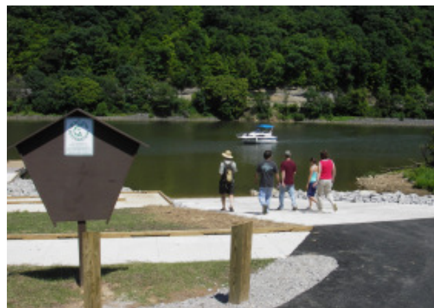
Greensboro, PA, launch ramp and parking lot constructed by PA Fish & Boat Commission. The event featured is October 14, 2007, Paddle the Mon at Greensboro, canoes furnished by PFBC. Restaurant is nearby in this historic area.