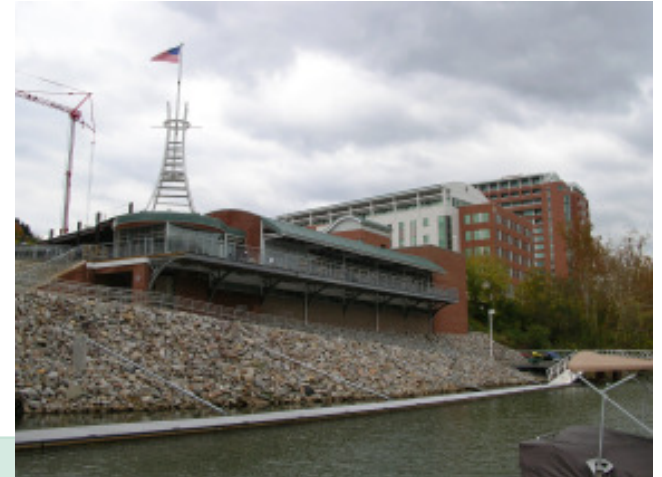
View from UMRC dock: Boathouse Bistro, WVU Foundation building, and Waterfront Place Hotel

This photo was taken from top of Jackson Kelly office building just north of the restaurant.