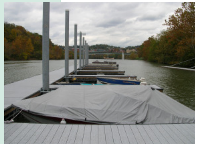
UMRC docks, looking north to Westover bridge. Note river fountain in distance at Morgantown's Hazel Ruby McQuain Park.