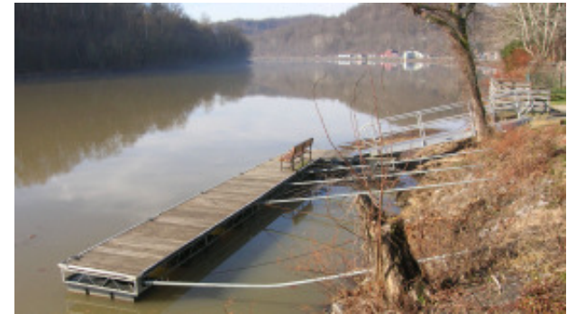
South and miles upstream from Morgantown are Rivesville public docks. Nearby in this small town are gas station, minimart, pavilion, and seasonal docks.