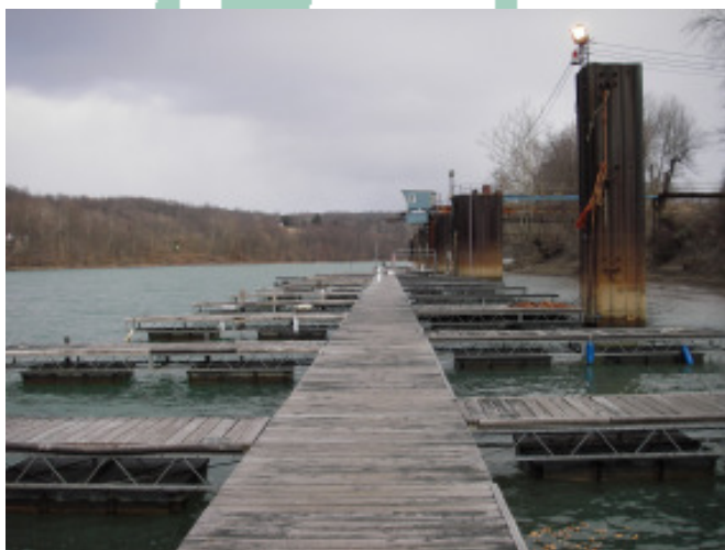
Docks at Two Rivers Marina & Campground, Dilliner, PA, just north of Point Marion. Great full-service bar and restaurant.