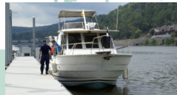
The 52-foot Enchantress

Myers-Smith, Pallay, Huguenard, Jernejcic