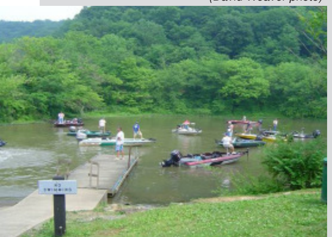
WV BASS Federation tournament at Pricketts Fort State Park.