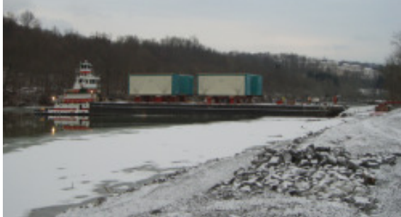
Condensers for Longview powerplant delivered by barge to new WV DNR recreational boat launch ramp at Monongalia County Industrial Park. January 2009.

Go to UpperMon.org for information about Marcellus drilling.