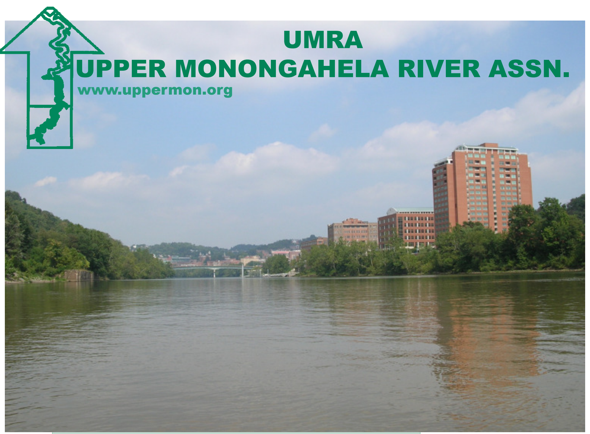
Monongahela River at Morgantown, W.Va., 8-29-08. The Waterfront Place Hotel, site of the Mon River Summit, casts a stately reflection.