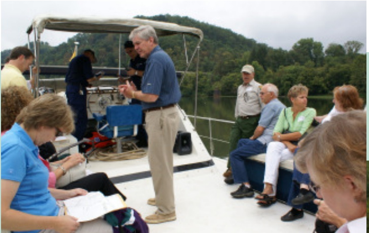
Aboard the Enchantress