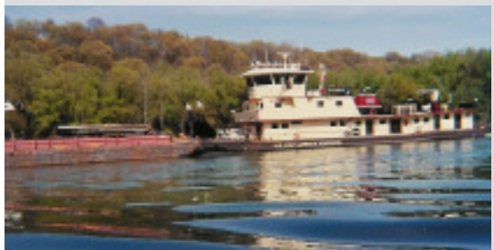
Corps of Engineers' M/V Evanick pushing work barges near Granville.

Col. Mike Crall (lower right), District Engineer of the Pittsburgh District, U.S. Army Corps of Engineers, gave an overview on key projects and current status of facilities. The Pittsburgh District comprises 26,000 square miles in five states (NY, WV, PA, OH, and MD) and oversees 23 navigation locks and dams on ten river systems. Its 628 employees are responsible for operation and