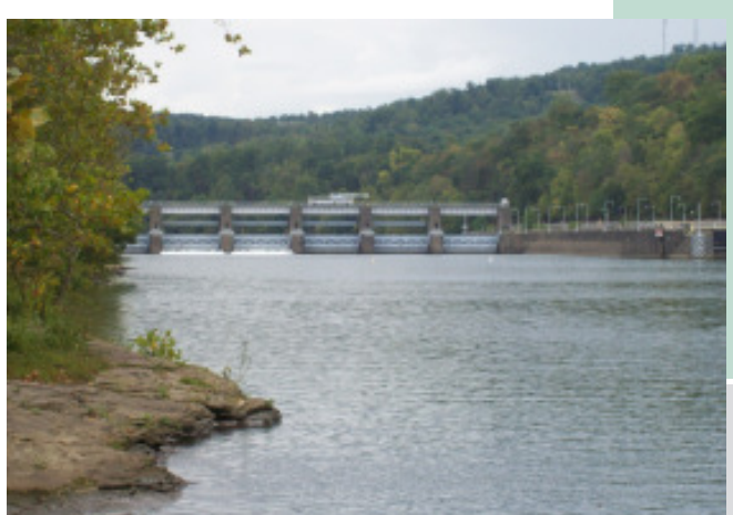
Morgantown Lock and Dam. At left is "Red Rock," a historic popular jumping-off place for swimmers

Attention was given to the importance of recognizing the role of the Corps of Engineers, of access to locks for recreational boating, and Corps funding shortfalls for maintenance and improvement of river transportation.