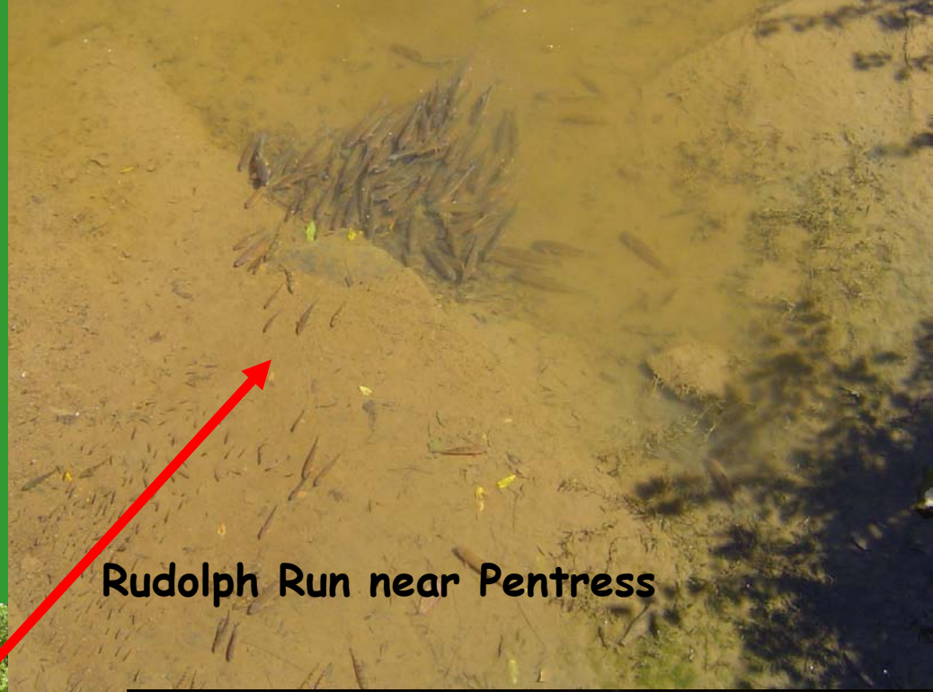
Rudolph Run near Pentress

Tributary mouths served as refugia. However, flows were too low to allow large fish to move upstream and escape toxicity of Dunkard Creek.